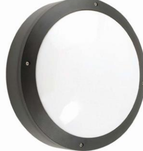
OF Open Face